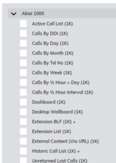
Example of reports available in Akixi 1000