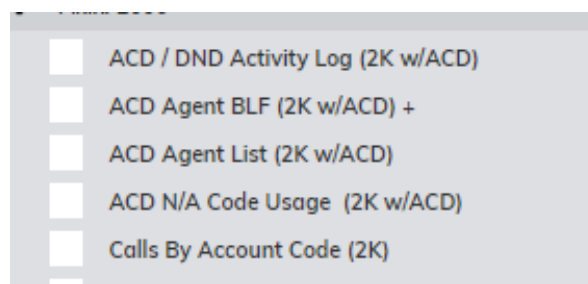
Example of reports available in Akixi 2000

All ACD Reports require the "Agent Add-on" in addition to the user license.